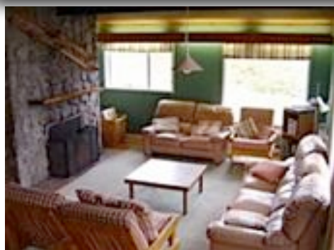
The Sundowner living room

Should you get locked out of the lodge there is a hidden key... contact Jennie for details →